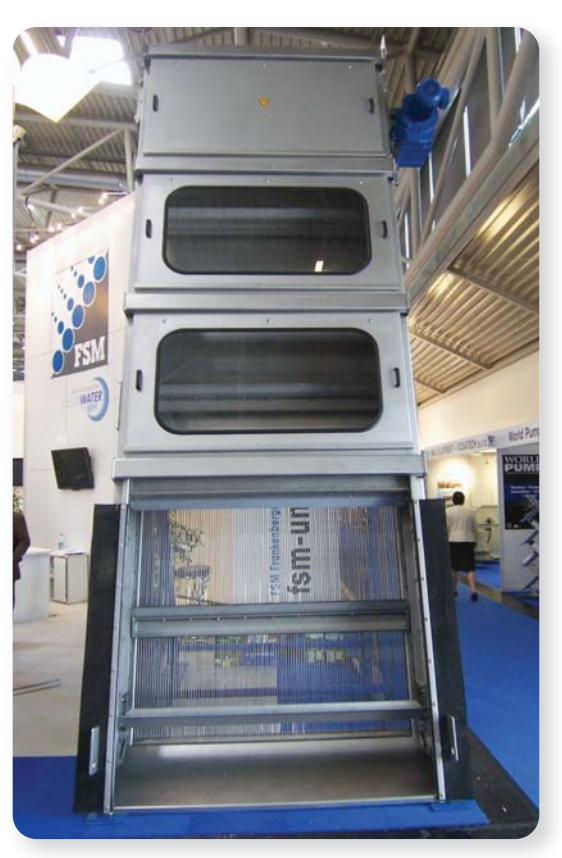
Covers with a view