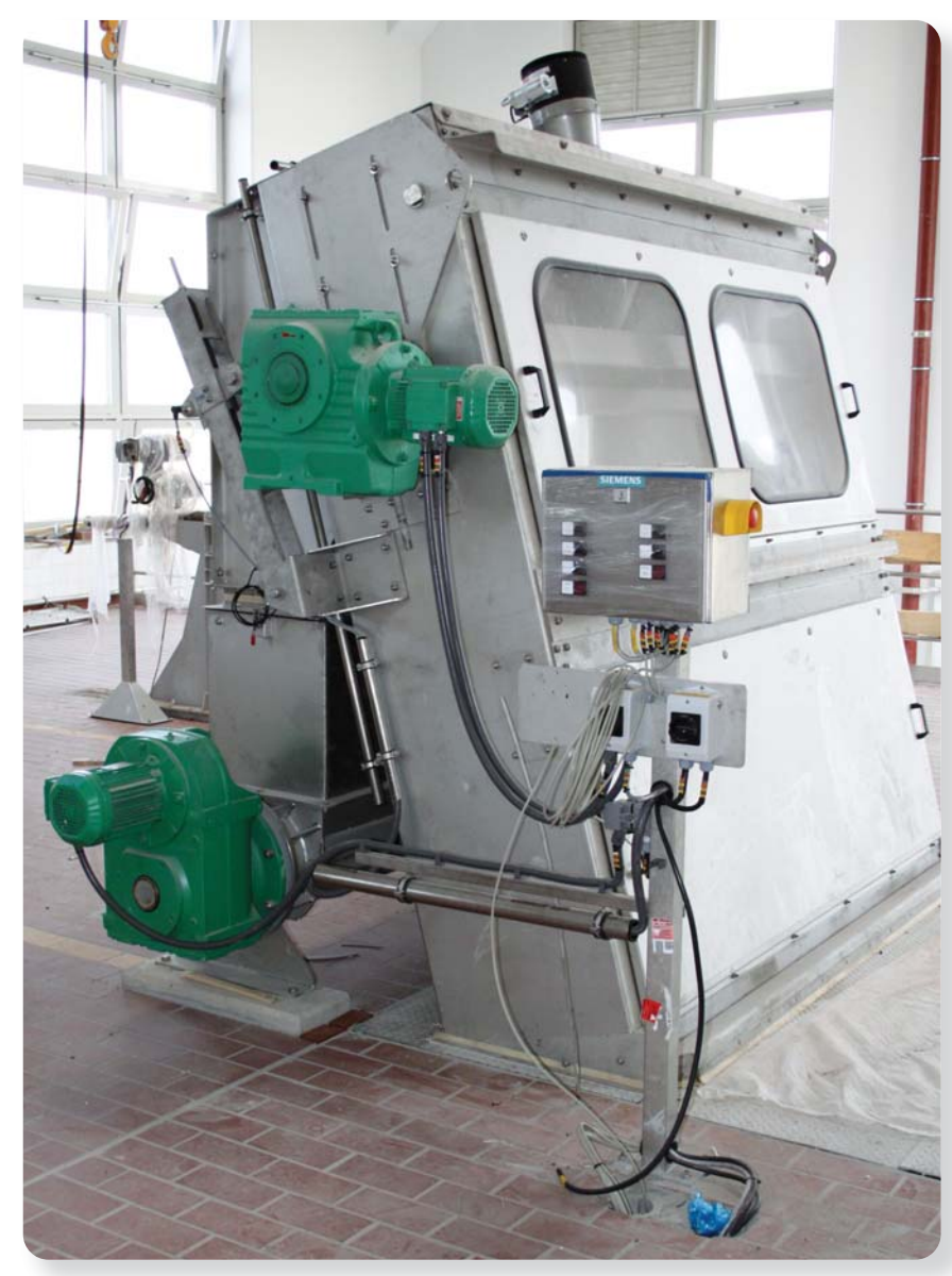
Over 150 FSM MultiRakes installed worldwide.

The rake teeth penetrate the bar openings removing the collected solids as they move up the bar rack. As the rake reaches the discharge point, an automatic cleaning device removes the solids. The return path of the rakes is on the upstream or dirty side of the bar field. This prevents any carry-over of screenings to the clean side of the channel.