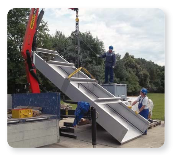
Field assembly of long MultiRake Screen.